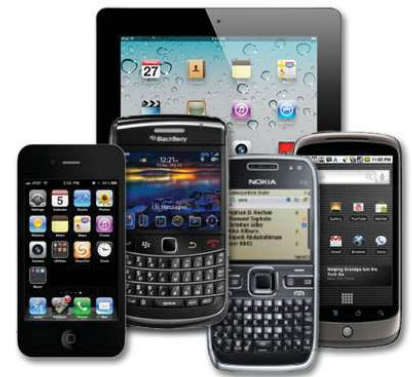
Figure 3: ShoreTel Mobility is natively integrated with the device UI

As we have seen, a comprehensive mobile UC solution like ShoreTel Mobility not only easily extends Unified Communications to mobile devices, but also addresses the challenges a BYOD initiative brings to a business.